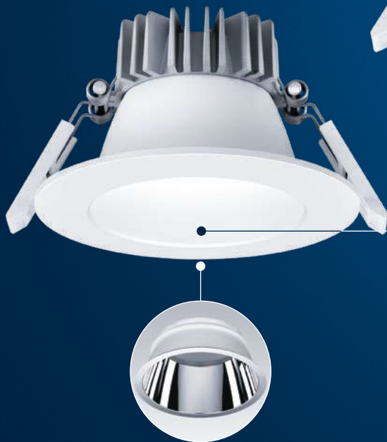
SMALL (S) CUT OUT: 95 – 125 MM

high performance of up to 3400 lm. With a recessed depth of 100 mm, each size can cover differences in the ceiling cut-outs of 3 – 4 cm. No retrofit-rings are needed, creating no colour differences or installations steps at the ceiling, making the Cetus perfect for refurbishment projects.