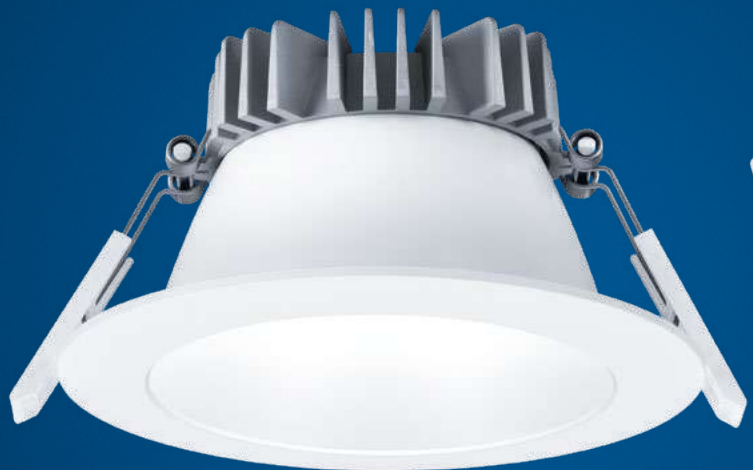
MEDIUM (M) CUT OUT: 145 – 180 MM

For a <math><19</math> UGR, an aluminium reflector can be added as an accessory.