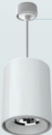
Cable Suspended KC6 Series OD 140mm 500mm - 3000mm Rod Suspended KR6 Series OD 140mm 500mm - 3000mm

Available in 3500K and CRI 90 specifically to assist meeting the new J6 regulations, the Kimbal range helps achieve the balance of performance, design and energy efficiency required in new buildings.