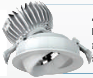
Adjustable Recessed KA6 Series Ø150mm OD 165mm / H 160mm