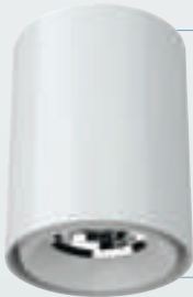
Surface Mounted KS6 Series OD 140mm H 195mm