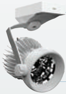
Spotlight KSP6 Series OD 135mm