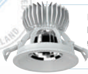
Fixed Recessed KF6 Series Ø150mm OD 165mm / H 148mm